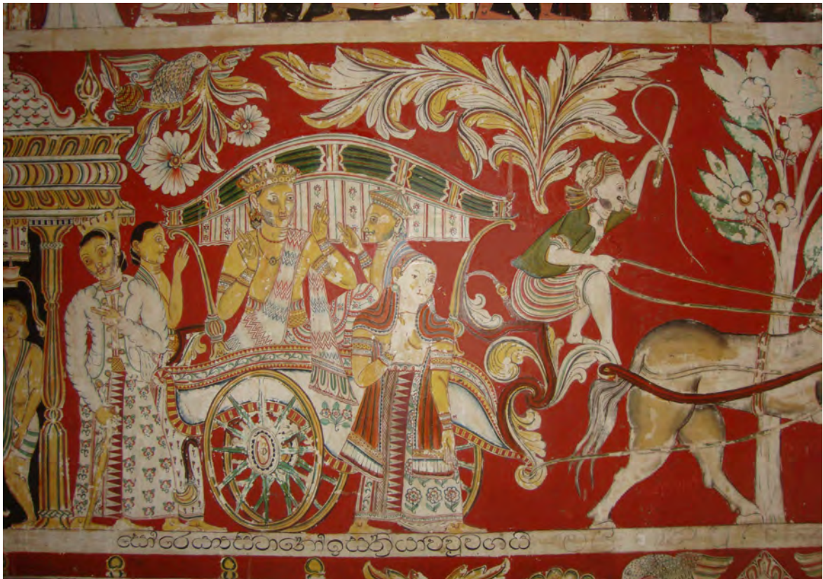
Fig. 2. Soreyyā is now a woman and travels to Taxila. Kathaluwa Purvārāma Mahāvihāraya (Ahangama, Galle District, Sri Lanka). Caption: Soreyya siṭānan strībhāvayaṭa pēmina Taksalā nuvaraṭa giya vagayi , “That treasurer Soreyya became a woman and went to Taxila.”