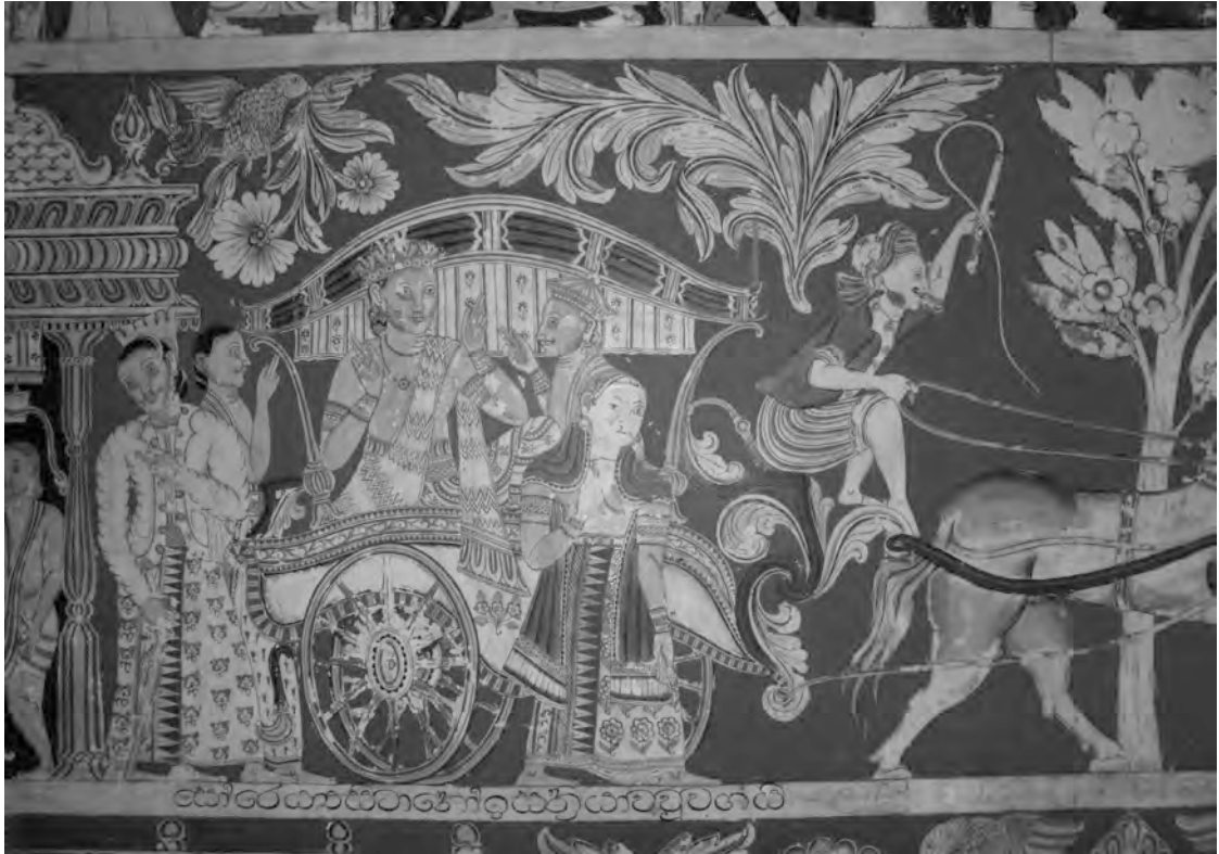
Figure 1. Soreyya changes sex. Kathaluwa Purvārāma Mahāvihāraya. Caption: Soreyya siṭānō istriyāva vū vagayi, “That treasurer Soreyya became a woman.”