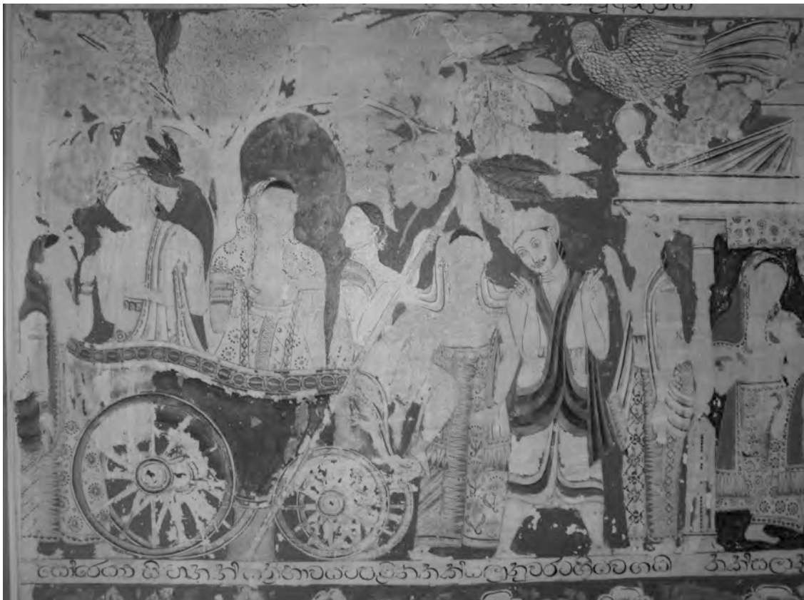
Figure 2. Soreyyā is now a woman and travels to Taxila. Kathaluwa Purvārāma Mahāvihāraya. Caption: Soreyya siṭānan strībhāvayata pēmina Taksalā nuvaraṭa giya vagayi, “That treasurer Soreyya became a woman and went to Taxila.”